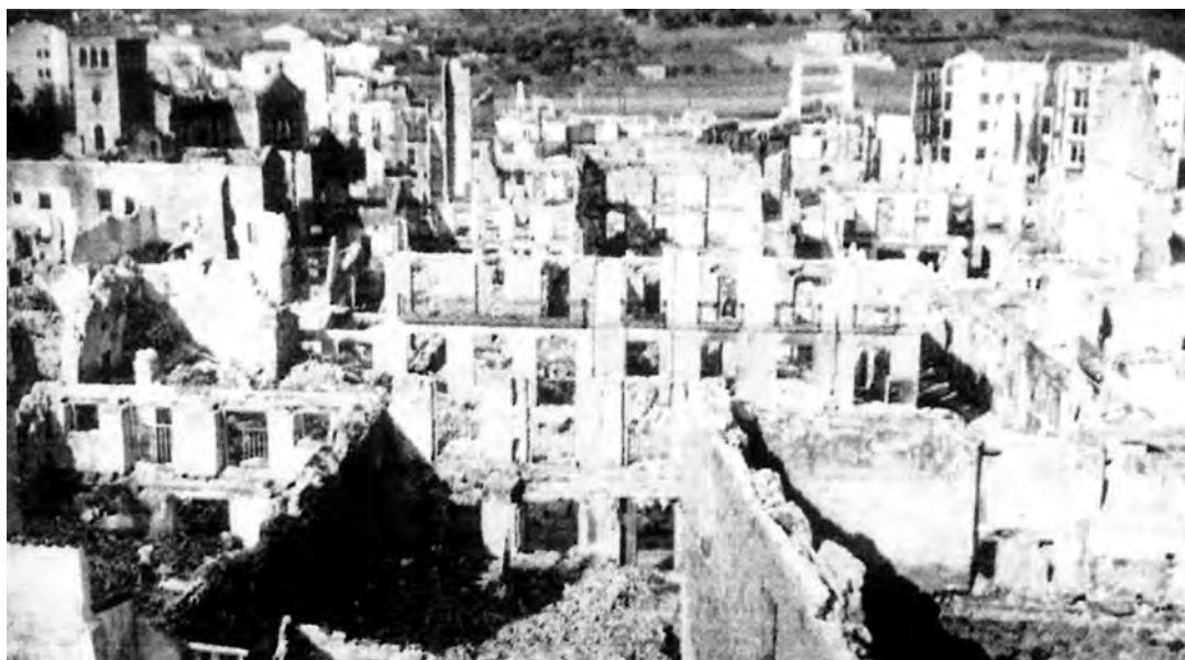
A photograph of Guernica after being attacked by German bombers in 1937.