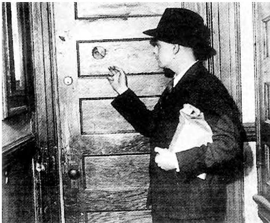
An American visiting a speakeasy.

13 Study the photograph, and then answer the questions which follow.