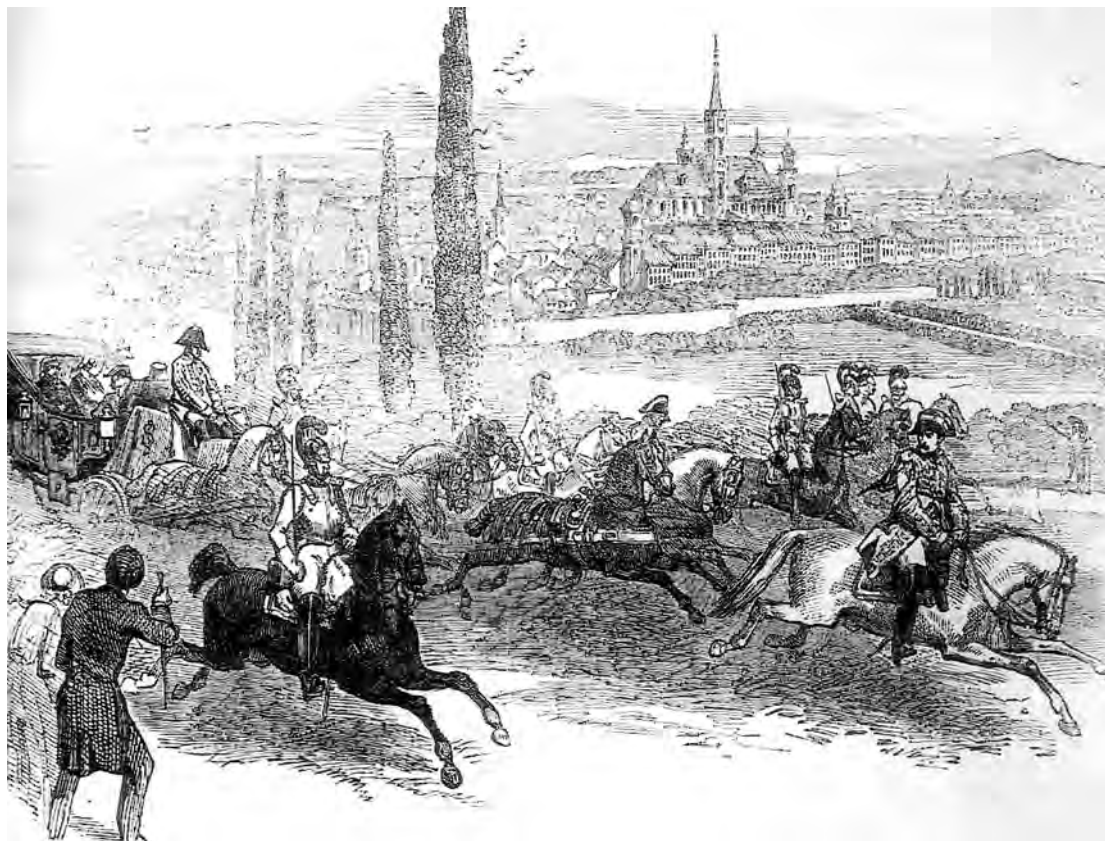
The Emperor of Austria abandoning Vienna and heading to Innsbruck, May 1848.