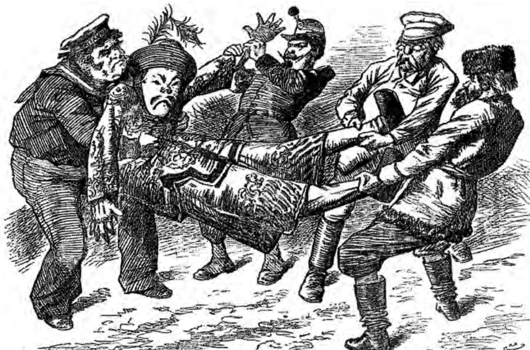
A nineteenth-century cartoon showing China being pulled in different directions by several European countries.

24 Study the cartoon, and then answer the questions which follow.