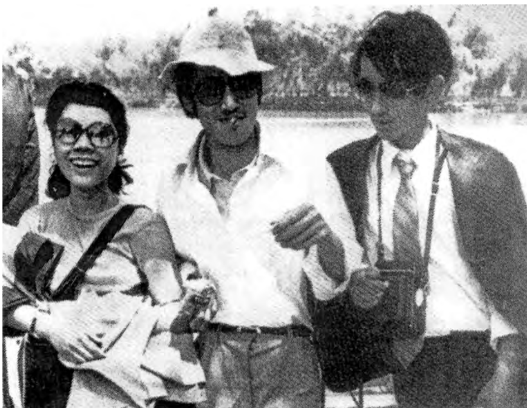
Young Chinese people on the streets of Beijing in the 1980s.

16 Study the photograph, and then answer the questions which follow.