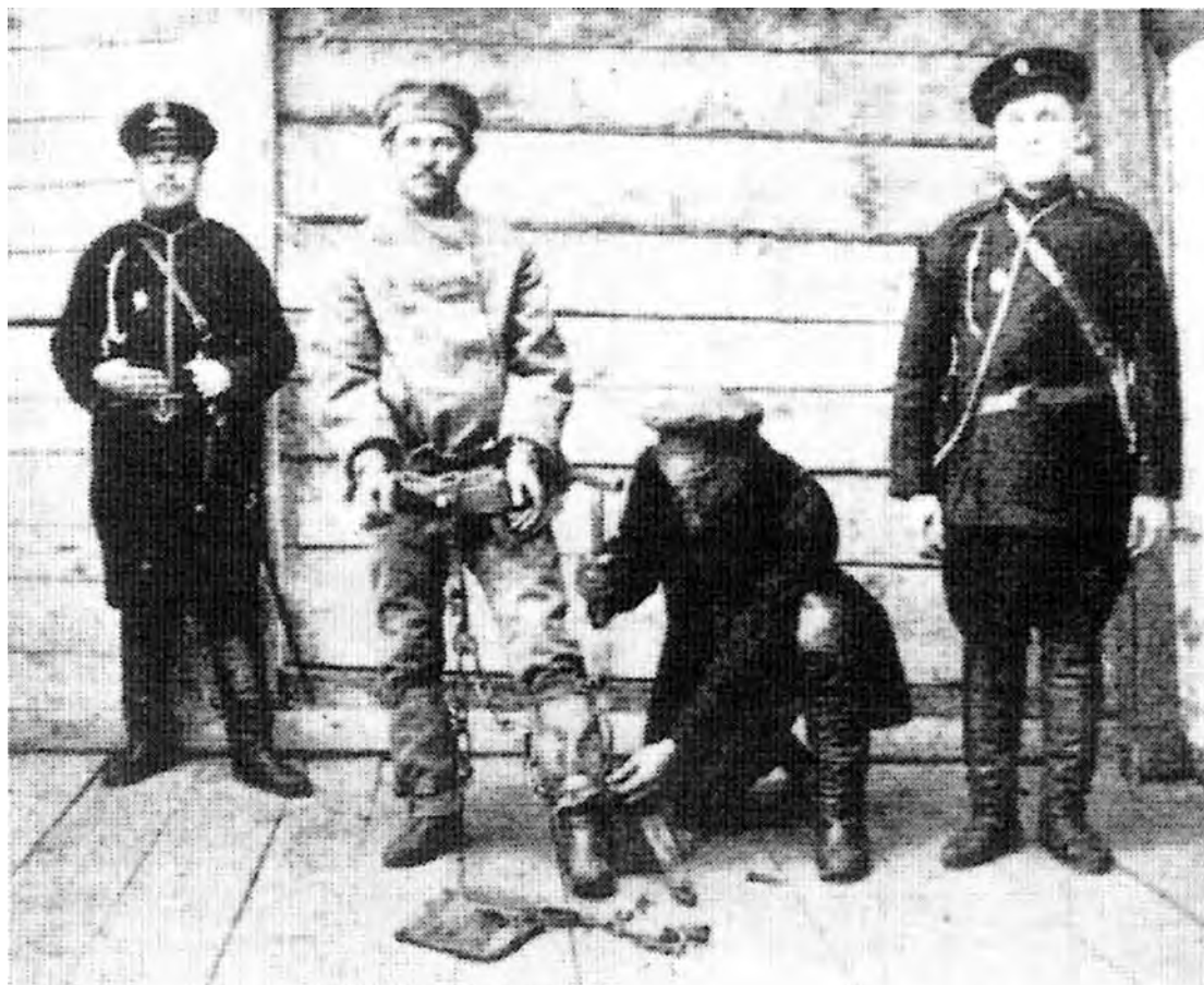
A prisoner of the Okhrana.

11 Study the photograph, and then answer the questions which follow.