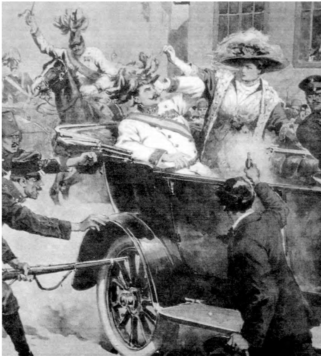
An illustration of the assassination of Franz Ferdinand and his wife in Sarajevo, June 1914.